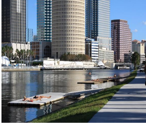
Img 1 : Bowery Bayside (South Tampa)